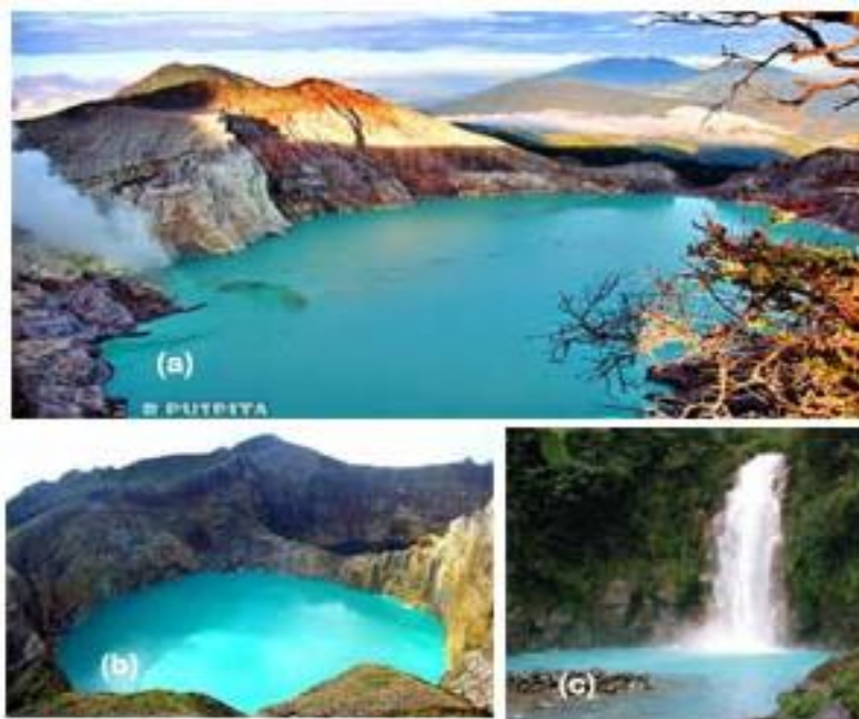
Figure 3: Different Volcanic Area Turquoise Freshwater Bodies a- Kawah Ijen, Indonesia b- Kawah Kelimutu, Indonesia c- Rio Celeste, Costa Rica