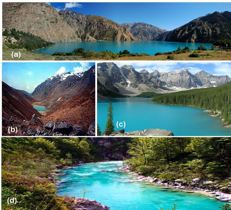
Figure 2: Different Glacial-Fed Turquoise Freshwater Bodies a- Phoksundo Lake, Nepal (source: www.wikipedia.org ) b- Lake Samiti, India (source: www.questhimalaya.com ) c- Moraine Lake, Canada (source: www.wikipedia.org ) d- Soča River, Slovenia (source: www.feel-planet.com )

Lake Pukaki is one of the three lakes situated in the Aoraki Mount Cook National Park. It is a glacial-fed lake (Irwin, 1978). The lake is very famous for its stunning turquoise appearance (Thompson-Carr, 2012). The turquoise appearance of lake is due to the finely-ground glacial flour (Gallegos et al. , 2008).