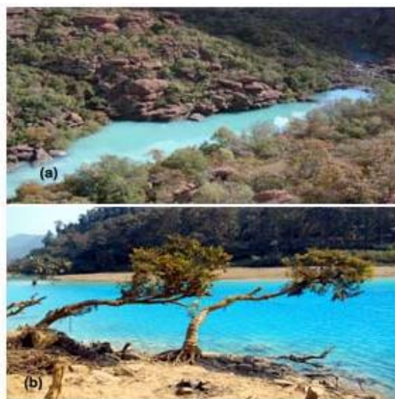
Figure 5: Two Turquoise Appearing Rivers as a Result of Anthropogenic Activities a- Wilge River, South Africa b- Lukha River (Wah Lukha), India

Wilge River is a tributary of Vaal River in the central South Africa. It originates near Leandra. It flows into the Bronkhorspruit River downstream of Bronkhorspruit town and drains the eastern part of the region (“Department of Water Affairs and Forestry”, South Africa, 2004). As a result of extensive coal mining and acid mine drainage (AMD), a turquoise or milky-blue colour was observed in the river in the month of June. The occurrence of milky-blue colour could be due to gypsum precipitation, which is a common by-product of lime neutralisation, and may originate from the Brugspruit Mine Water Treatment plant (Dabrowski et al. , 2013). It is also believed that the colour might be due to the precipitation of aluminium compounds as a result of neutralisation reactions in pH-neutral waters (McCarthy and Pretorius, 2009). However, the actual mechanism behind the coloration in the river remains unknown.