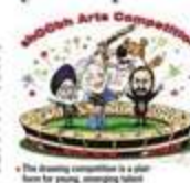
The drawing competition is a platform for young, emerging talent

I mparting an important lesson — to fight between fire and water, and to hold a gun, among other things — the shOObh Arts Competition will open up a new world for the city's children. The first day of the competition is on September 1, and the final day is on September 5. The competition is open to all children, and the winners will be awarded a trophy and a certificate. The competition is a great way for children to express their creativity and talent.