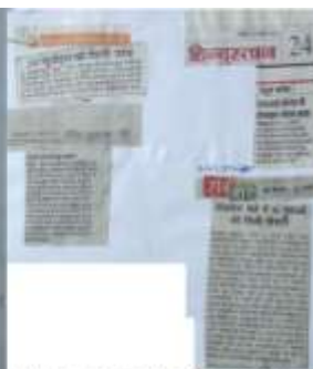
NIOS JOB FAIR-2015

MILLENNIUM POST | New Delhi | Monday, November 23, 2015